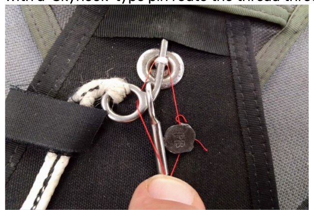
Ensure that the seal cannot fall into the grommet.