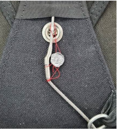
With a 'Skyhook' type pin route the thread through the eye of the pin.