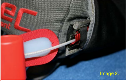
Representation of the plastic tuck-tab handle in a serviceable condition.

British Skydiving is the trading name of British Parachute Association Ltd. A company limited by guarantee. Registered in England & Wales no 875429. Registered office: 5 Wharf Way, Glen Parva, Leicester LE2 9TF.